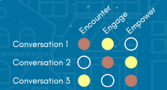
Figure 3: The Order of Conversations