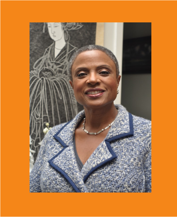
Senior Pastor City of Refuge UCC Oakland, CA